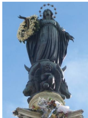
Statue of Our Lady in Piazza di Spagna